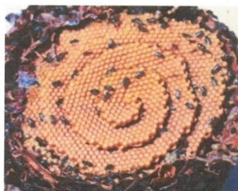
Brood comb of a native Australian stingless bee ( Tetragonula carbonaria ) colony

Native social stingless bees are already being successfully used for pollination of crops such as: macadamias, mangoes, watermelons, lychees.