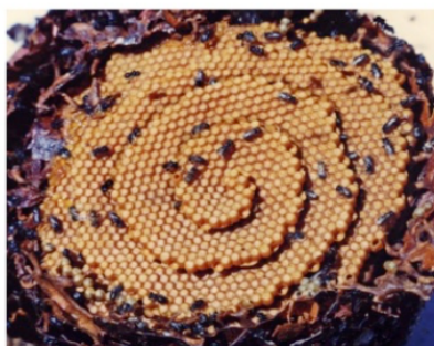
Brood comb of a native Australian stingless bee ( Tetragonula carbonaria ) colony

Native social stingless bees are already being successfully used for pollination of crops such as: macadamias, mangoes, watermelons, lychees.