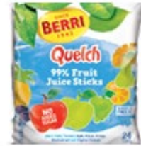
Fruit Tube – 80c