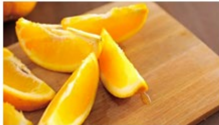
Frozen Orange Quarter – 10c