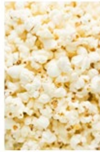
Popcorn - $1.20