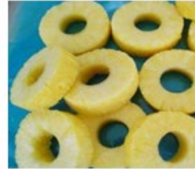
Frozen Pineapple Ring – 50c