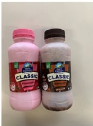
Flavoured Milk - $2.30