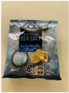
Sea Salt Chips - $1.50