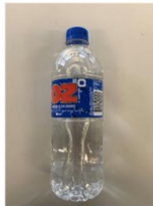
Water Bottle $2.30