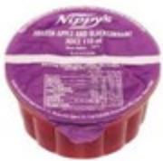
Orchy Cup - $1.50