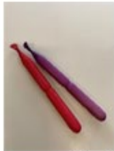
Snap Stix- $1