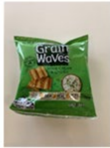
Grainwaves - $1.50