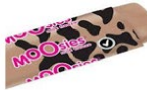
Chocolate Moosie - $1.50