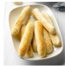
Breadstick – 20c