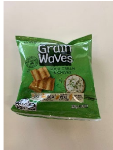
Grainwaves - $1.50