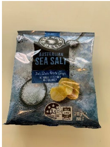
Sea Salt Chips - $1.50

From our “special order day” this Thursday 1 st December until the end of the term the following will be available to purchase from the canteen for cash over the counter.