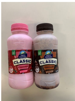
Flavoured Milk - $2.30