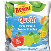
Fruit Tube – 80c