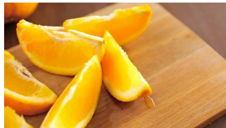
Frozen Orange Quarter – 10c