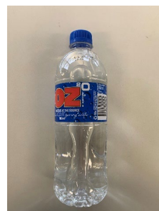
Water Bottle $2.30