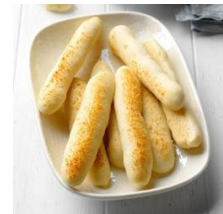
Breadstick – 20c