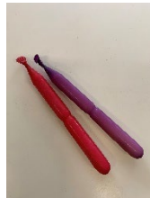
Snap Stix- $1