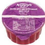
Orchy Cup - $1.50