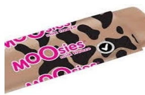
Chocolate Moosie - $1.50