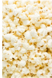
Popcorn - $1.20