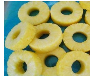
Frozen Pineapple Ring – 50c