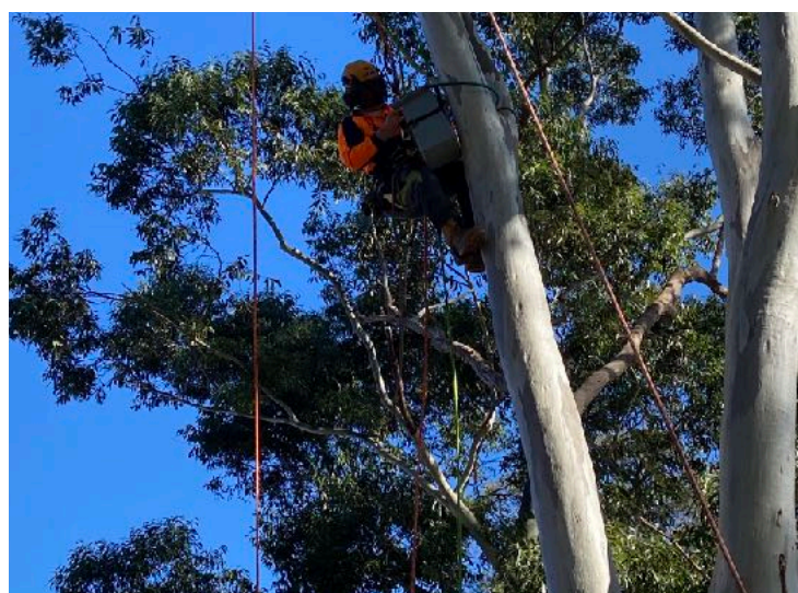
Brad from Finesse Trees installing 1 of 4 bird nest boxes near the school driveway to provide shelter for local birdlife who can't find vacant tree hollows.