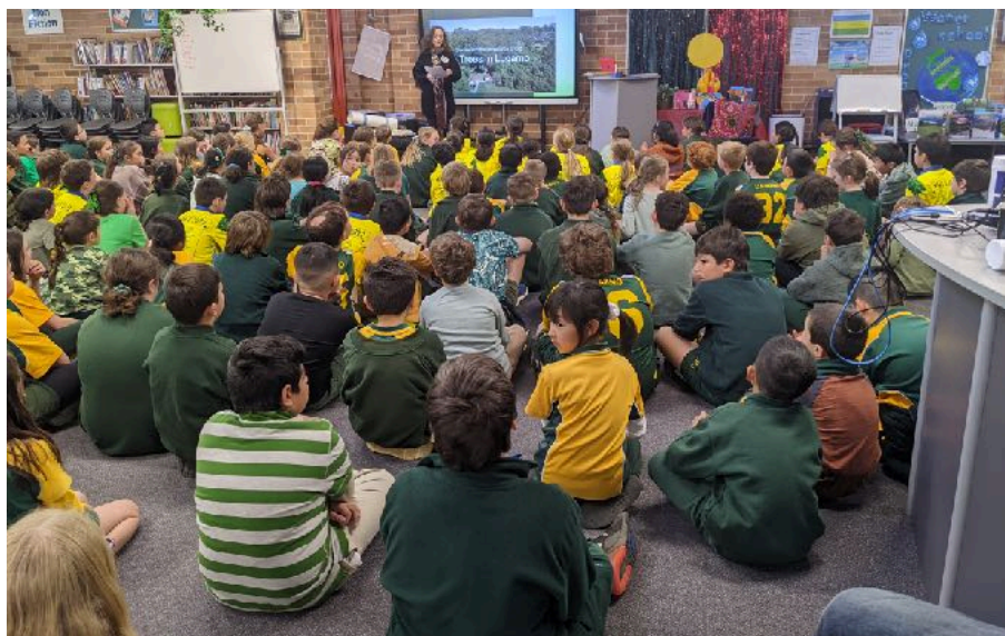
Insightful guest talk on the significance of old trees & how hollows can take up to 70 years to form.